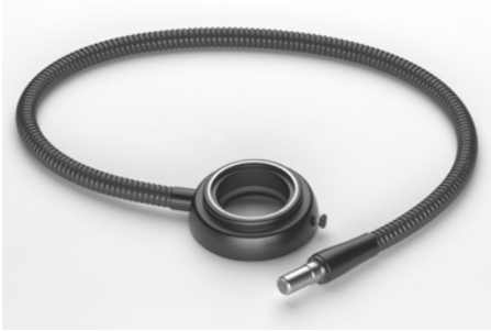
Annular ringlight Jumbo 66 mm